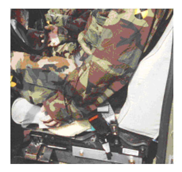
Figure 4. Non-enclosed Button in Prototype Application

As was demonstrated in the rollover testing, it is very important to protect the buckle from inadvertent release. As shown above, this can be done by installing or positioning the buckle itself to reduce the potential for contact during a crash or by designing the buckle to have a button that is difficult to inadvertently depress to such an extent to cause a release. This can also be done through design of the latch plate to guard the release button from inadvertent contact.