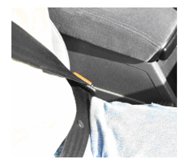
Figure 3. Non-enclosed Button in Original Application

While the non-enclosed buckle was well protected from inadvertent actuation by its location in proximity to the center console in its original application as shown in Figure 3, it was not protected on the system tested in the rollover tests as seen in Figure 4.