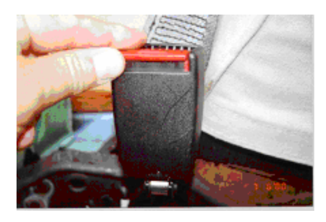
Figure 1. Buckle with Non-enclosed Button

arm was moving towards the buckle just prior to the release. It was concluded the flailing arms of the dummy contacted the release button of the buckle, thus causing the release [2]. The buckle used on this prototype was taken from a production vehicle and integrated to the prototype seating system. This buckle had a non-enclosed release button as shown in Figure 1.