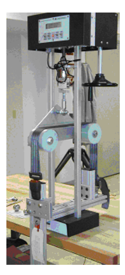
Figure 6. Test Setup