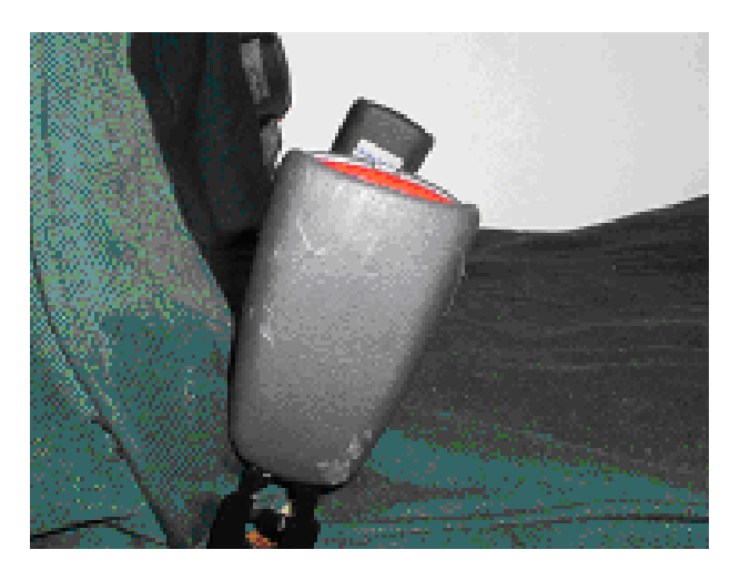
Figure 2. Buckle with Enclosed Button

It was this non-enclosed design and its placement which allowed the button to be depressed by the flailing arm/hand and release. The buckle was changed to the enclosed design on all latter prototypes as shown in Figure 2.